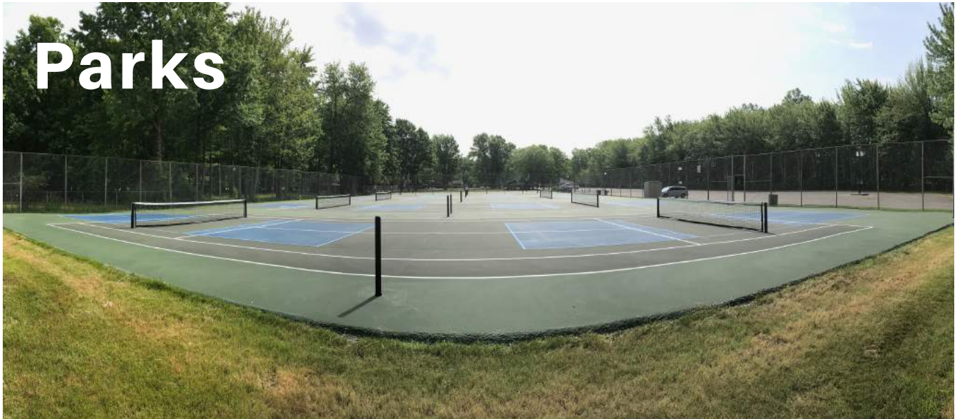
Newly renovated tennis courts at South Central Park. Courts serve pickleball & tennis enthusiasts.